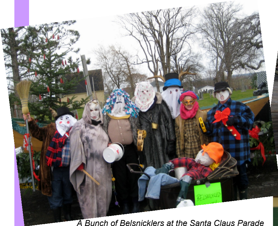
A Bunch of Belsnicklers at the Santa Claus Parade