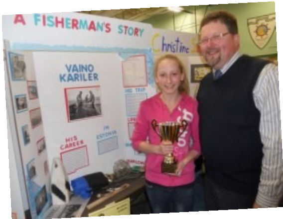
Fisheries Museum Choice Award at the Heritage Fair