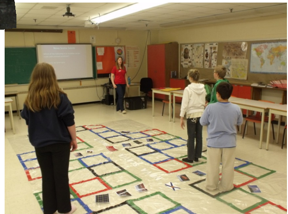
Heritage Game at PVEC Knowledge Festival