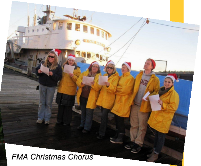
FMA Christmas Chorus