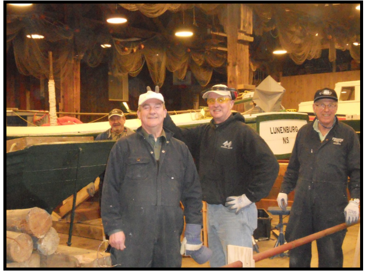
Thanks to Staff for their dedication, determination and teamwork!

The Lunenburg Marine Museum Society is pleased to announce the commencement of a major building project at the Fisheries Museum of the Atlantic. This project will encompass a stabilization of the western section of the museum. It represents a positive and necessary change to the museum building infrastructure and will result in an improved environment and experience for all visitors and our staff.